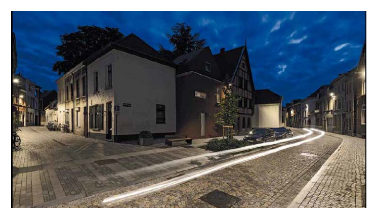
Figure 5: Mechelen's street lighting

The city of Mechelen has over 10,000 street lights installed with a total electricity consumption of more than 4.4 million kWh per year. In the city centre, traditional street lighting has been replaced in stages between April and June 2012 by 577 innovative high-quality LED lighting units spread over 90 streets. LED lighting has brought great improvements in safety, the environment and the general ambience. The new lighting units result in expected energy savings of 37% and have much longer lifetimes (approximately 60,000 hours). The installed system is future-proof and can easily be upgraded to keep pace with the rapid evolution of LED technology, which will permit additional energy savings. The project was implemented by the Flemish regional electricity distribution network operator Eandis.