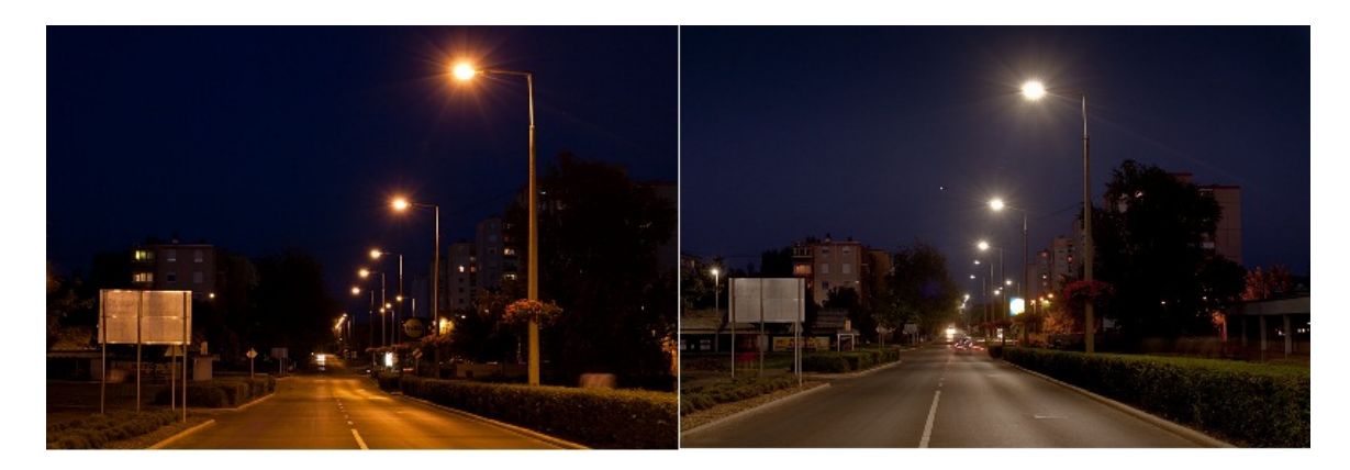
Figure 3: Kaszap Road, replacement of HPS by LED

In 2010 and 2011 more than 6,000 new LED street lighting luminaires were installed in the city of Hódmezővásárhely. The energy savings achieved are 35% and the new lighting solution is nearly maintenance free. Through the new SSL solution the lighting levels and the overall visual comfort and feeling of safety have been significantly increased.