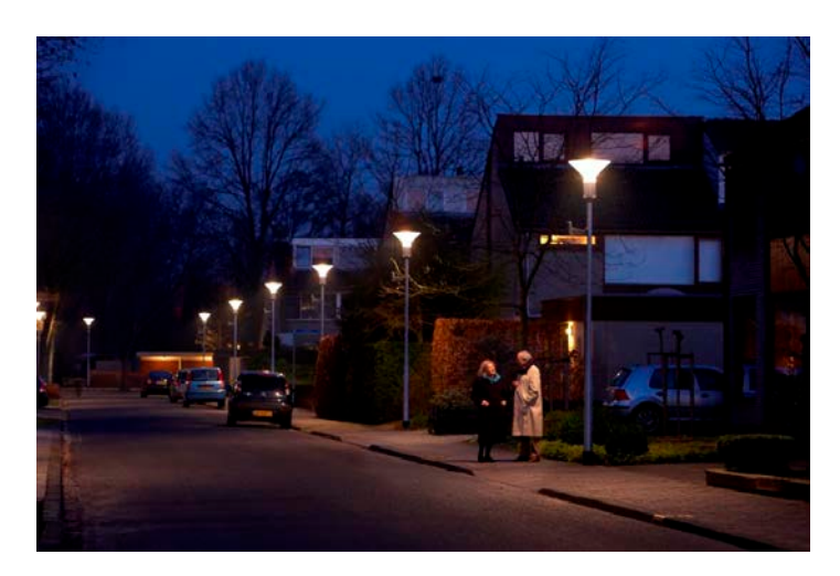
Figure 6: New LED lighting in Tilburg