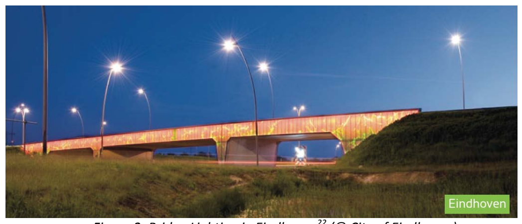
Figure 2: Bridge Lighting in Eindhoven<sup>22</sup>

Eindhoven is the use of colour to provide safety information and to reduce environmental impact. Coloured lights have been installed in the pavements as auxiliary safety indicators to better highlight pedestrian and cyclist crossings in the city, and low intensity green lighting has been deployed on rural cycle paths to improve visibility and minimise impact on the local fauna.