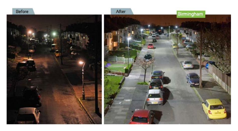
Figure 1: The impact of LED deployment in Birmingham