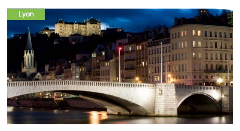
Figure 4: Lyon city centre<sup>24</sup>

to provide distinct lighting identities across the city. In addition, Lyon has adapted the design of lighting at pedestrian crossings, bus stops, etc. to aid people with visual and physical disabilities.