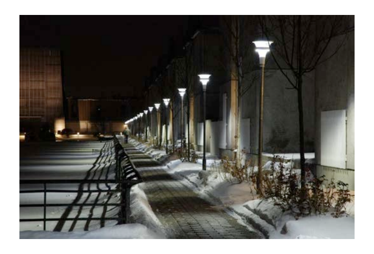
Figure 7: Albertslund street lighting

The municipality of Albertslund, located in the wider Copenhagen area, has adopted a new lighting plan which is solely based on LED technology. The plan includes the development and testing of different street lighting designs and Wi-Fi based smart control systems. In recent years, the town has contributed to the invention of several outdoor lamps, in close cooperation with designers and manufacturers; noteworthy is the award winning "A-lamp". Today, the first stage of a "Scandinavian Lighting and Photonics Science Park" is under development in Albertslund, with the 'Danish Outdoor Lighting Lab' (DOLL) as the driving force. Copenhagen, the European Green Capital 2014, will invest € 40 million to replace 21,000 street and traffic lights with SSL by 2015.